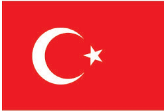
REPUBLIC OF TURKEY (EUROPE)